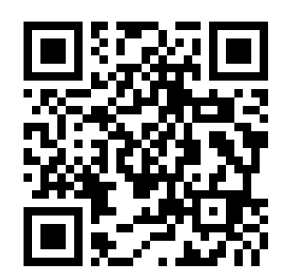
A Newcomer Asks